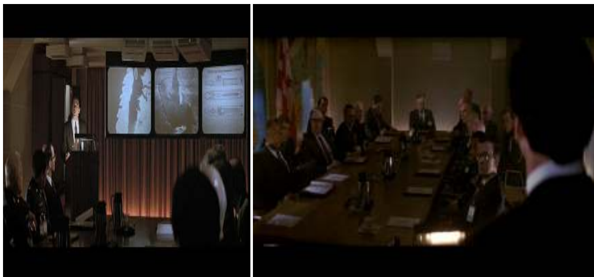
Fig17: Political Briefings and Debates

Also , The film includes several scenes featuring political briefings and debates, where policymakers discuss the implications of the Red October's actions and the potential consequences of a Soviet defection. These scenes highlight the ideological differences between the United States and the Soviet Union, as well as the tense diplomatic relations that characterized the Cold War era.