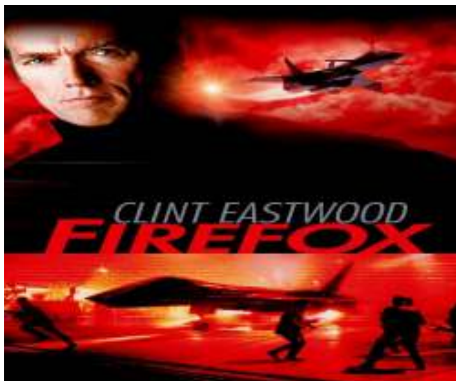
Fig 11: Firefox movie poster