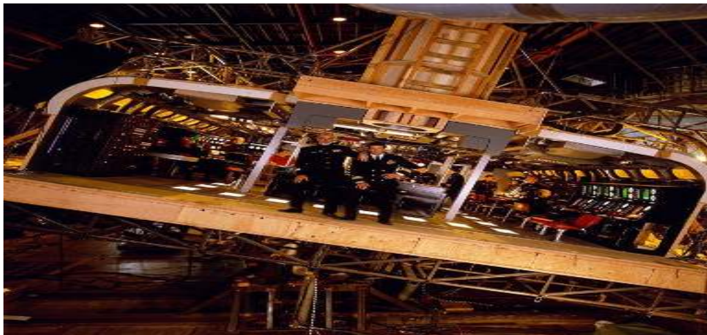
Fig 15: The interior of a submarine that's accurate to the smallest detail.