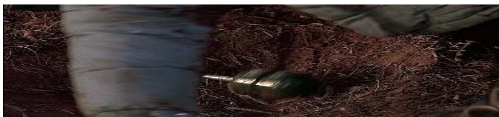
Fig21: the wolverines Setting booby traps

In the world of espionage, counter intelligence, and deception play significant roles. In "Red Dawn," the protagonists employ tactics to mislead and confuse the enemy. They set up booby traps, spread disinformation, and create diversions to thwart the invaders' efforts and protect their own operations. These scenes reflect the strategies used during the Cold War, where both sides engaged in espionage and counter intelligence to gain an advantage.