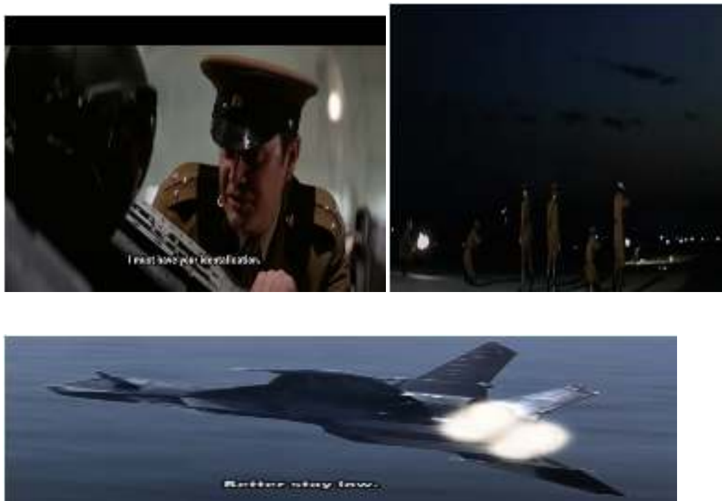
Fig12: Mitchell Gant infiltrated to the Soviet military base to steal a Firefox plane

Gant Mitchell infiltrates the Soviet military base, the film focuses on the stealth and subterfuge required in espionage. Gant utilizes various tactics, such as disguises, surveillance, and evasion techniques, to navigate through the base undetected. The scene highlights the cat-and-mouse game played by intelligence operatives during the Cold War, where every move must be carefully calculated to avoid detection.