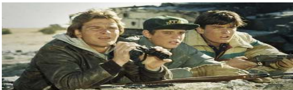
Fig20: Infiltration of enemy headquarters

One of the key espionage scenes in the film involves the protagonists infiltrating an enemy headquarters to gather intelligence. The group, comprised of American teenagers turned guerrilla fighters, sneaks into a Soviet camp to eavesdrop on conversations and collect crucial information. This scene showcases the resourcefulness and determination of the characters, highlighting their willingness to risk their lives to gain an advantage against the enemy.