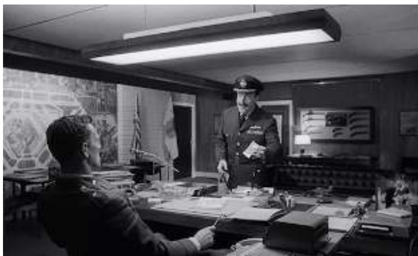
Fig9: General Ripper's Office