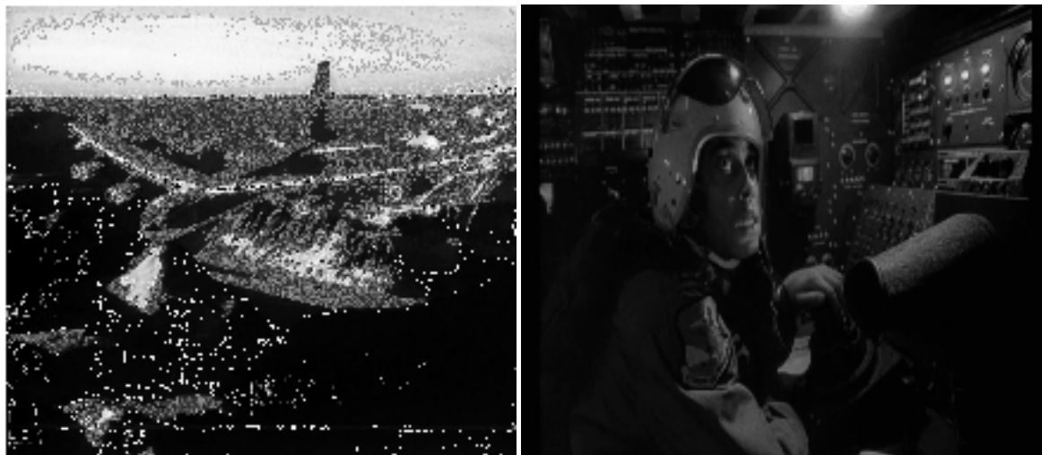
Fig10: The B-52 Bomber and the cramped interior of the plane