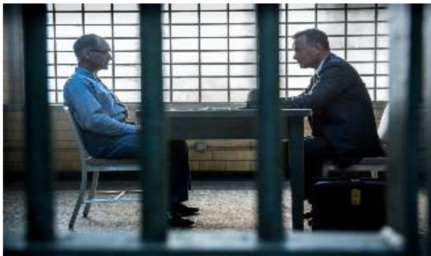
Fig 2: The arresting of Rudolf Abel (Mark Rylance), a Soviet agent living in NewYork

Source : Directed By Steven Spielberg : Poetics of the Contemporary Hollywood Blockbuster