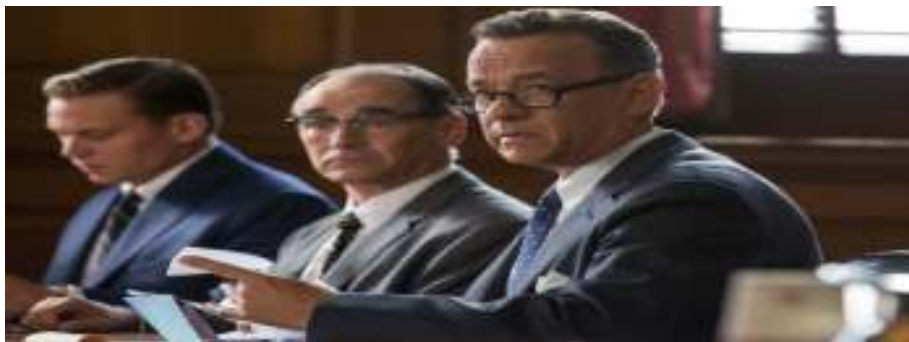
Fig 6: Courtroom Trial : Hanks and Rudolf Ivanovich Abel in a courtroom

Source : Directed By Steven Spielberg : Poetics of the Contemporary Hollywood Blockbuster