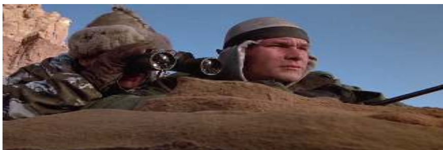
Fig 22: espionage scene

Espionage during the Cold War often involved psychological warfare, and "Red Dawn" touches upon this theme. The protagonists engage in psychological tactics, such as spreading fear and uncertainty among the occupying forces. They aim to weaken the enemy's morale and exploit any divisions within their ranks. These scenes reflect the psychological manipulation employed during the Cold War to gain an advantage in the ideological conflict.