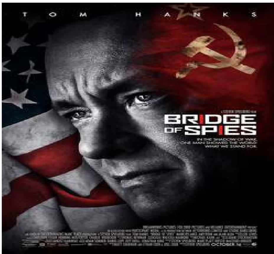
Fig1: Bridge of spies Theatrical release poster

Source : (Charman Matt et al. directors. Bridge of Spies. Touchstone Home Entertainment : DreamWorks Pictures 2016.)