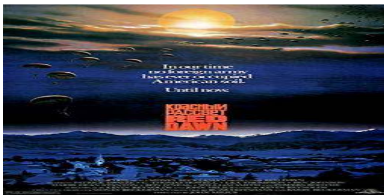
Fig19: Red Dawn ( 1984 ) : Movie Poster