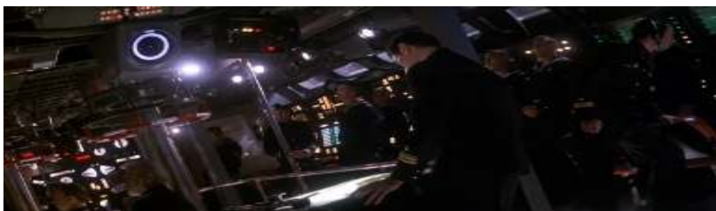
Fig16: The Naval Operations room

Then , the scenes in the naval operations rooms further emphasize the Cold War context. Strategic planning, the use of advanced technology, and the constant surveillance reflect the ongoing surveillance and intelligence gathering during this period. The rooms are filled with maps, radar screens, and communication devices, highlighting the military apparatus and the heightened state of alertness.