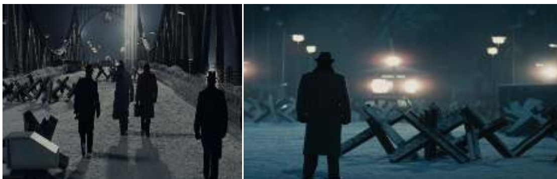
Fig 3: Donovan's Visit to East Berlin and The armed guards and constant surveillance in Berlin bridge

Following that , When James B. Donovan travels to East Berlin to negotiate the release of captured American pilot Francis Gary Powers, the scene vividly portrays the stark contrast between the two sides of the divided city. The austere and oppressive atmosphere , the presence of armed guards, and the constant surveillance reflect the tense and dangerous nature of the Cold War.