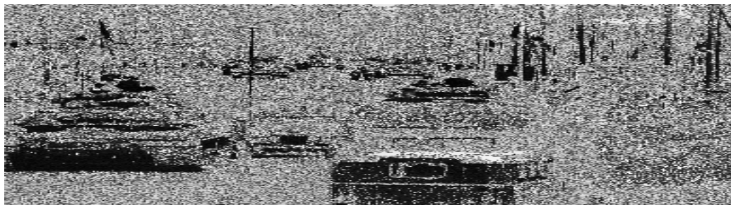
Fig5: The standoff at Checkpoint Charlie: Soviet tanks facing American tanks, 1961

Source : Directed By Steven Spielberg : Poetics of the Contemporary Hollywood Blockbuster ( Photo credit: U.S. Army Archives ).