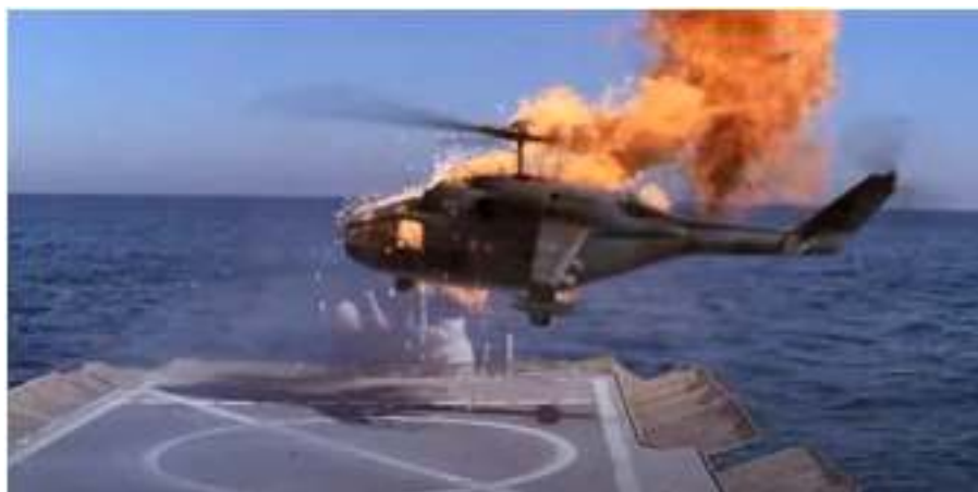
Fig13: Mitchell evades the pursuing Soviet forces and bombs them

After successfully stealing the Firefox, Gant must navigate through Soviet airspace and evade pursuit by Soviet forces. These scenes illustrate the intense cat-and-mouse chase that often characterized Cold War espionage. Gant uses his piloting skills and knowledge of evasive maneuvers to outmaneuver Soviet fighters and surveillance systems, further showcasing the high-stakes nature of the covert operations conducted during the era.