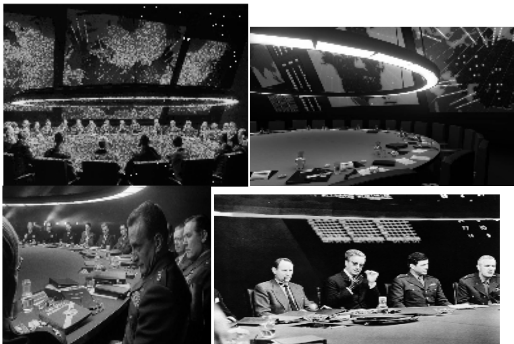
Fig 8: The war room and high-ranking officials gather to discuss the impending nuclear crisis