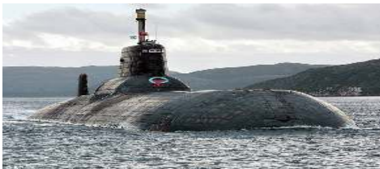
Fig18: A periscope was sighted in waters where British submarines would normally surface as they head into or out of the Royal Navy's submarine base at Faslane in Scotland.