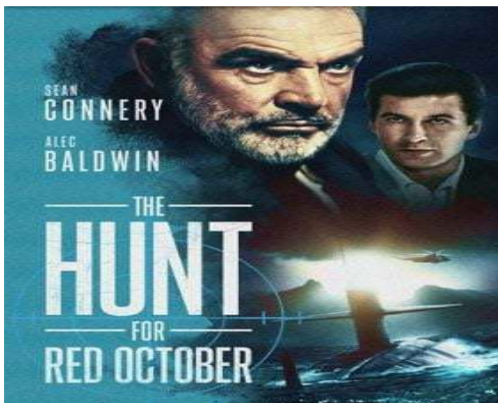
Fig .14: The Hunt for Red October : Movie poster