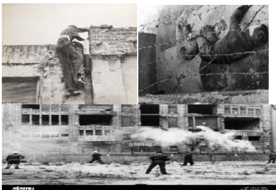
Fig 4: Escaping across Berlin wall

Moreover , the director depicted an attempted escape over the Berlin Wall . This scene captures the desperation and risks faced by those seeking to cross from East to West. The scene showcases the formidable barrier, the high-security measures, and the consequences faced by those caught or shot during escape attempts. It highlights the personal stories and human toll of the Cold War division.