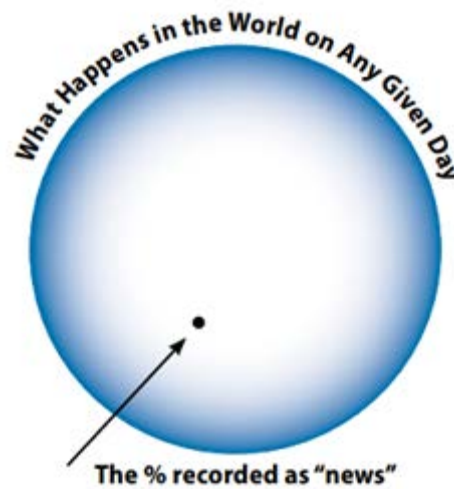
Figure N° 01:

The logic of constructing news stories is parallel to the logic of writing history. In both cases, for events covered, there is both a massive background of facts and a highly restricted amount of space to devote to those facts. The result in both cases is the same: 99.99999% of the “facts” are never mentioned at all (see Figure 1).