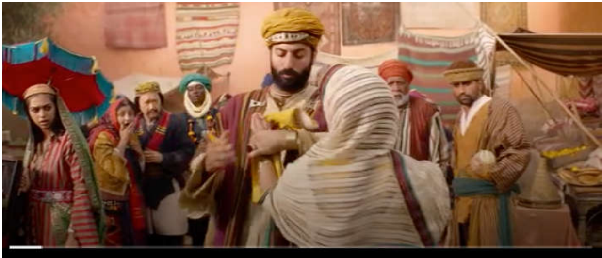
Figure 4: Screenshot 06 :55, the violent merchant with thick accent holding violently her hand

storyline (e.g., rescuing Jasmine from the merchant, illustrating how Aladdin gets into conflict with the law)