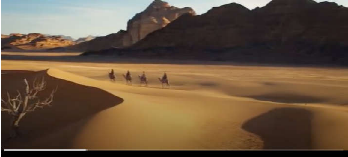
Figure 2: Screenshot 30 :41, Setting of Aladdin 2019

nations are desert places where the “heat is intense,” where camels and caravans roam. This might imply that the Oriental subject cannot thrive nor survive outside of the Sahara. In addition to the luxury castles and wealthy sheikhs, geography figures a slew of prejudiced depictions.