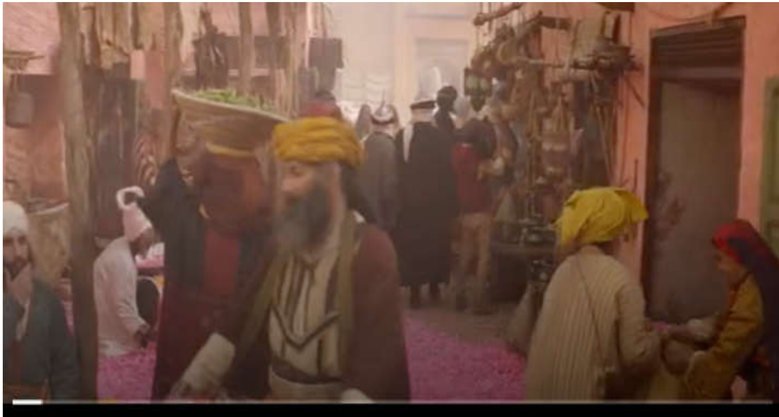
Figure 3: Screenshot 04 :48, Moorish market

According to Said, Orientalism is only a system of representations whose ultimate goal is to instill false beliefs in Western minds, facilitating the seizing of Arab territories and legitimizing Western imperialism. The illustrations of women in Aladdin adhere to the same guidelines and adhere to Orientalist norms.