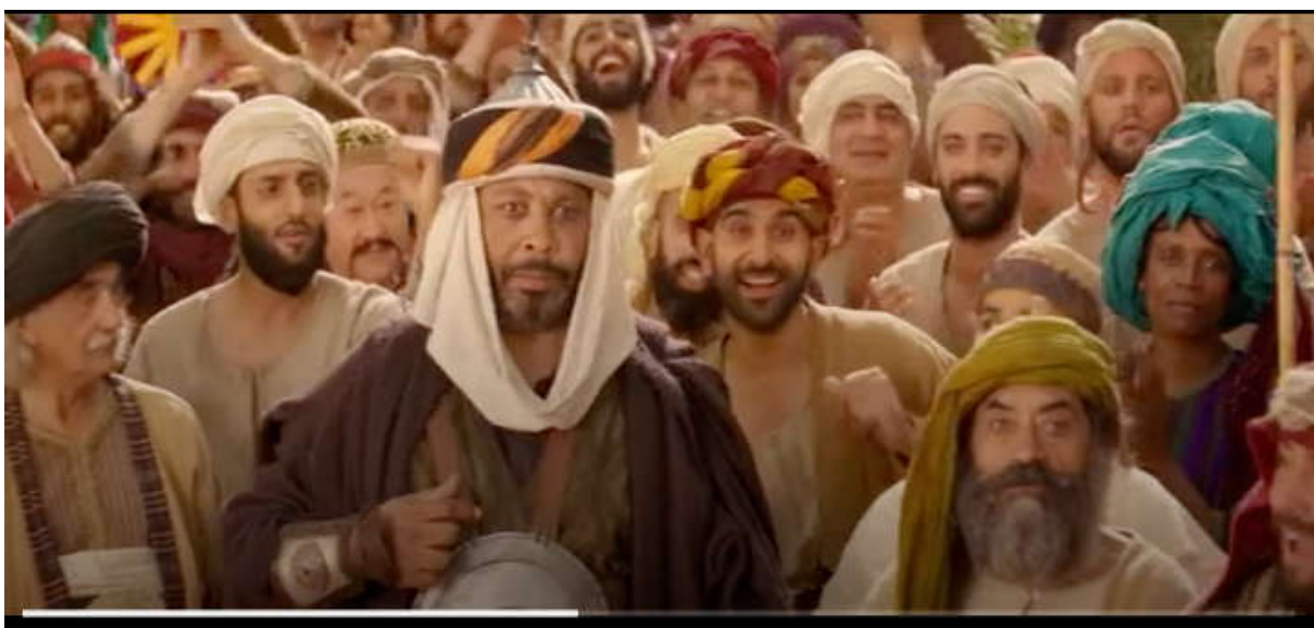
Figure 6 : Screenshot 53 :00 , men wearing turbans

This description, as Fawina Soo Hoo argues, allows for the presentation of a wide range of genuine Middle Eastern and South Asian clothes; Afghani payraans, Middle Eastern streetwear, textiles imported from the Middle East, Indian sarees, Omani daggers, and other items can be seen . Furthermore, unlike in Aladdin, not every Arab guy wears a turban, but those that are visible today appear to truly mirror turbans from the Gulf and East .