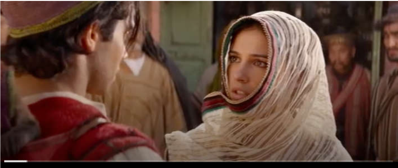
Figure 5: Screenshot 07 :21, veiled princess

Furthermore, it may be claimed that while dealing with Arab women, Disney adopts not just an Orientalized but also a racialized viewpoint. Arab women are the subjects of numerous stereotypical depictions that demonize Islam and the Arab world as a whole. Through various portrayals as women of the harem, veil wearers, or belly dancers, Women of the Orient are objectified and shown as a product for sale. When Aladdin got wealthy, he returned to the Sultan and asked for the princess, bringing valuable things to "buy her," to which she answered,