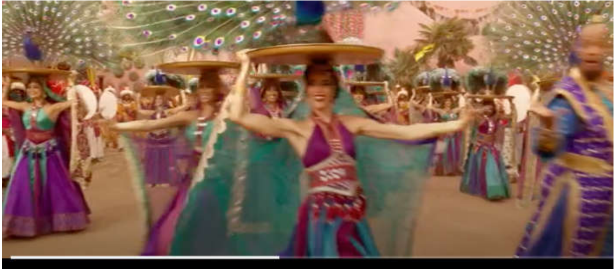
Figure 5: Screenshot 55:49, Belly dancers scene

These women's bodies are shown through provocative attire, identifying them as objects of desire whose primary function is to please men's needs and fulfill their sexual needs. As Jafar told Jasmine, Jafar: "Life will be kinder to you, Princess, once you accept these traditions and understand it's better for you to be seen and not heard."